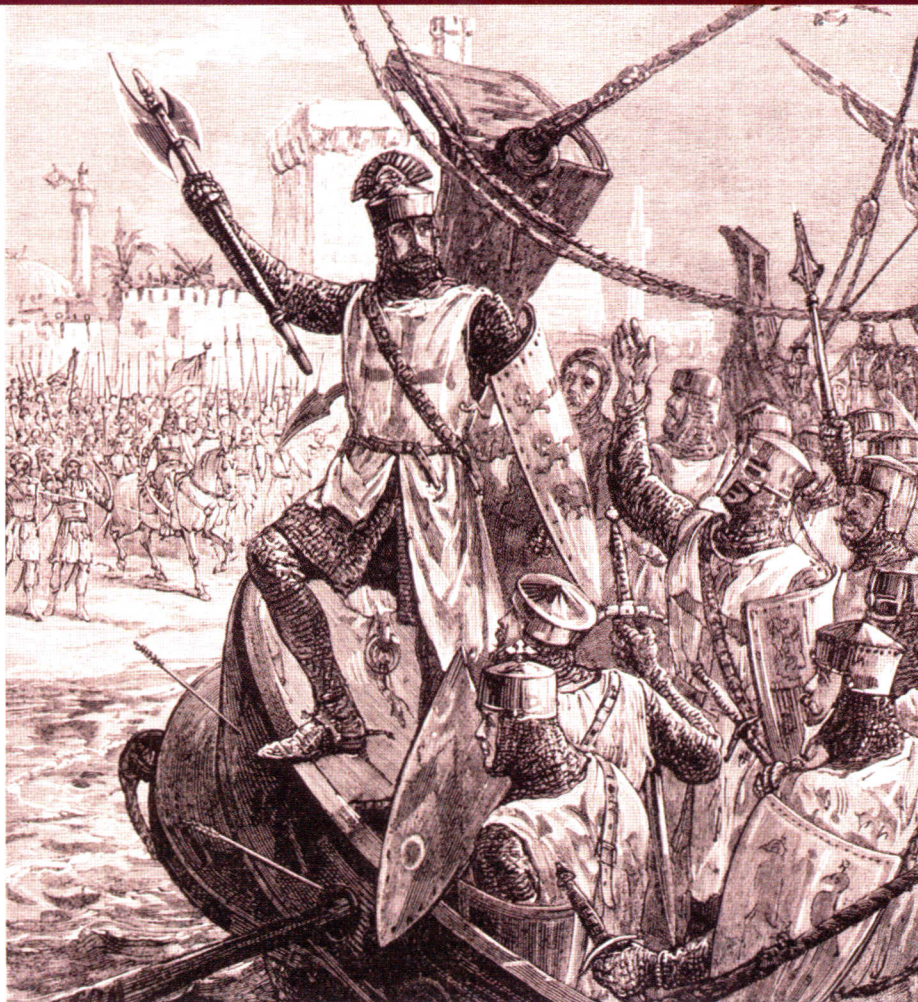
Abandoned by his allies, England's Richard the Lionheart earns his nickname, forging on ahead and retaking the Holy Land's entire coast in the Third Crusade.

Having said this, it would be naïve to think that all Crusaders' worldly endeavors were animated by heavenly thoughts. Some say that Pope Urban II might have hoped he could regain control over the Eastern Church after the Great Schism of 1054. It's also said that Urban and others wanted to give those militant medieval knights someone to fight besides one another. As for those on the ground, the Crusades involved a motley multitude encompassing the regal to the rough-hewn, and it is certain that some among them dreamt of booty and betterment. Yet is this surprising or unusual? People are complex beings. Within a group or even an individual's mind, there are usually multiple motivations, some noble, some ignoble. Charles the Hammer might have very well relished the glory won on the battlefield, for all we know. But it would be silly to think that was his main motivation for fighting the Moors. Likewise, if the Crusaders were