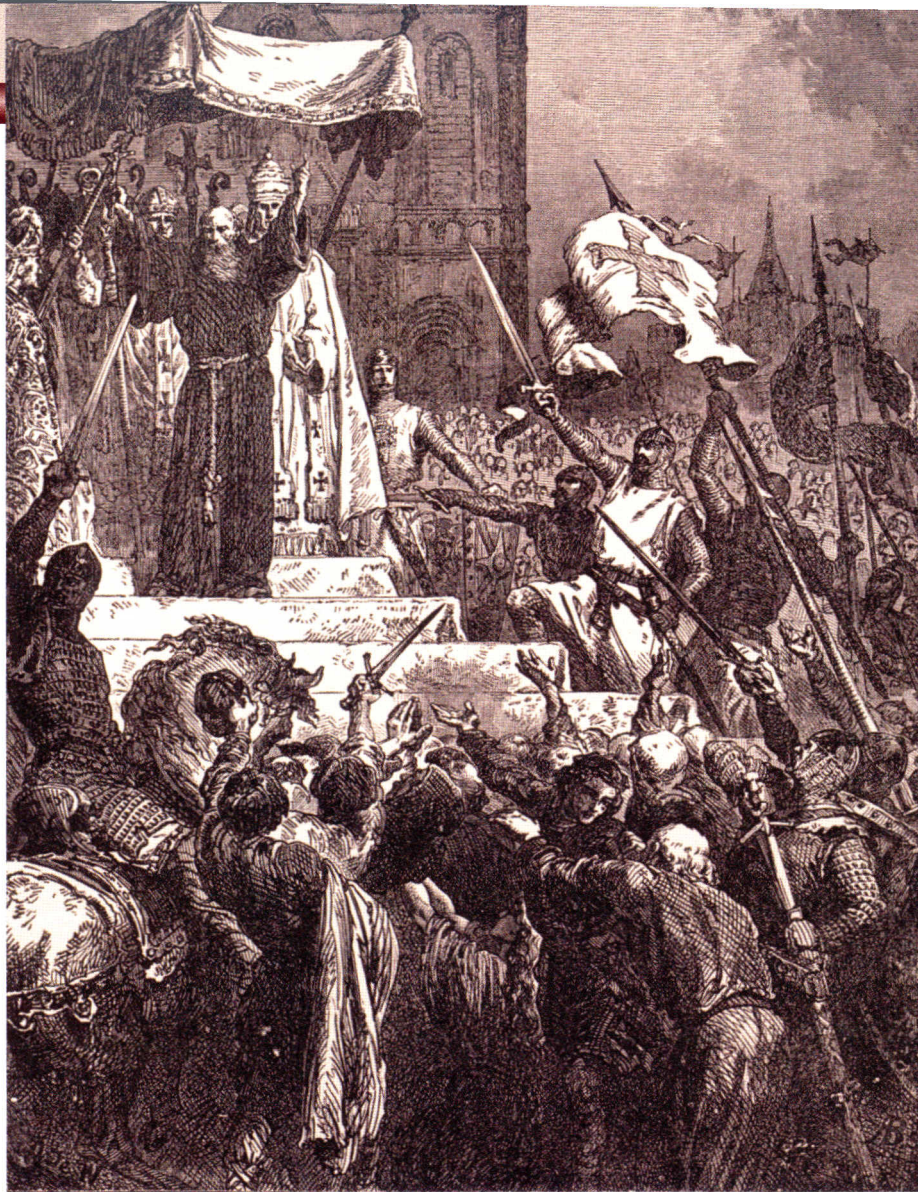
Preaching the First Crusade in 1095: Confronted by Islamic hordes that have already conquered two-thirds of the old Christian world, a call to action and arms rings out across Europe.