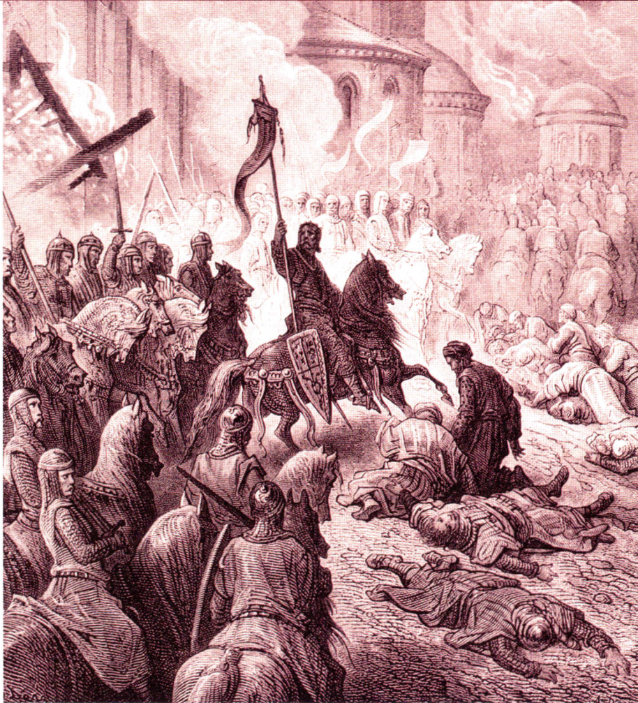
Although Pope Innocent III had excommunicated the Fourth Crusade, he couldn't stop it from sacking the eastern Christians' capitol, Constantinople, and cementing the Great Schism of 1054.

No pope ever called a Crusade against Jews. During the First Crusade a large band of riffraff, not associated with the main army [the aforementioned "People's Crusade"], descended on the towns of the Rhineland and decided to rob and kill the Jews they found there.... Pope Urban II and subsequent popes strongly condemned these attacks on Jews. Local bishops and other clergy and laity attempted to defend the Jews, although with limited success. Similarly, during the opening phase of the Second Crusade a group of renegades killed many Jews in Germany before St. Bernard was able to catch up to them and put a stop to it.