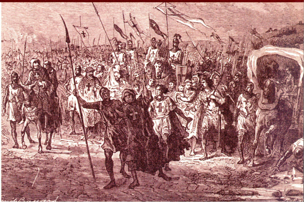
General Patton squared: The Crusaders had to march 1,500 miles; deal with hunger, thirst, and the unknown; and then push back a force that had been expanding continually for 400 years.

Today we like to say "Follow the money." Well, if you followed it in the 11th century, it led right back to Europe. The reality is that most Crusader knights were "first sons," men who had property and wealth — much to lose (including their lives) and little to gain. And just as the United States can drain the public treasury funding Mideast interventions today, medieval warfare was expensive business. Lords were often forced to sell or mortgage their lands to fund their Crusading, and many impoverished themselves. It